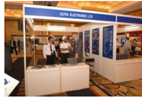
Ultra Electronics Ltd Exhibition Booth