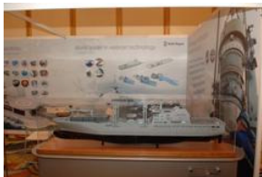
Rolls Royce Exhibition booth