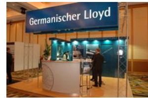
Germanischer Lloyd Exhibition booth

There was a steady stream of visitors to the exhibition, which was open throughout DTA 2007. Visitors also included participants from HMSA2007. The exhibition provided exhibitors and visitors the opportunity to discuss the latest technology and facilitated networking.