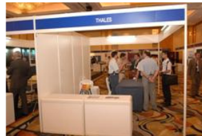
Thales Exhibition Booth