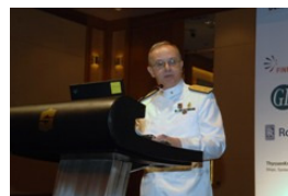
VADM Dino Nascetti