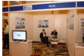
S3LOG Exhibition booth