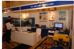
Sea and Land Technologies Exhibition Booth