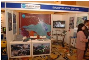
Eurocopter South East Asia Exhibition Booth