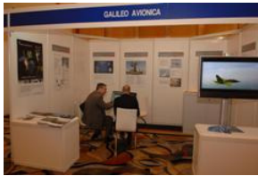
Galileo Avionica Exhibition booth

There was a steady stream of visitors to the exhibition, which was open throughout DTA 2007. Visitors also included participants from HMSA2007. The exhibition provided exhibitors and visitors the opportunity to discuss the latest technology and facilitated networking.