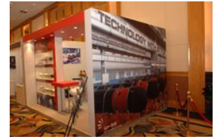
Whitehead Alenia Sistemi Subacquei Exhibition Booth