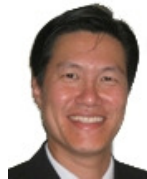
COL Low Yong Joo Commander Naval Logistics Command Republic of Singapore Navy